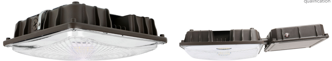
(shown with Emergency Battery)

*Not all product variations listed on this page are DLC qualified. Visit www.designlights.org/search to confirm qualification