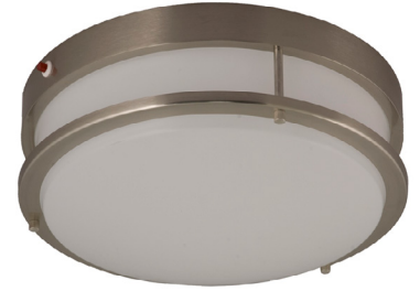
Emergency Battery Back Up High Frequency Sensor Bi-Level Emergency Battery Back Up / High Frequency Sensor Bi-Level