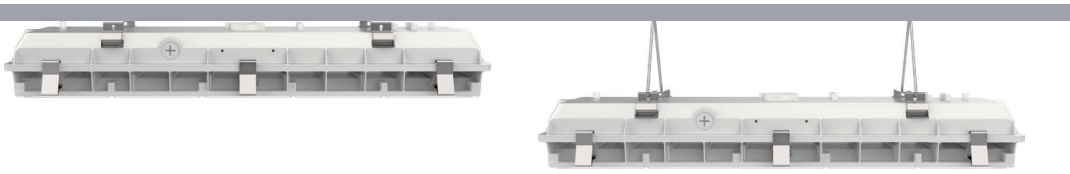
Surface Mount (Standard with included brackets)